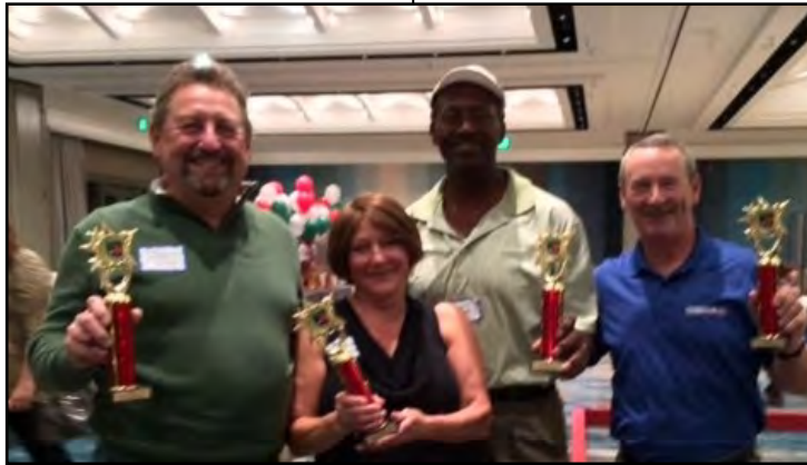
First-Place Bocce Winners "Botchy Ballers"

(Golf & Bocce Tournament cont. on page 6)