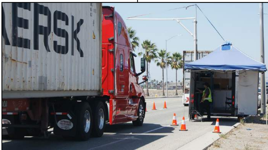
A truck is inspected at Port of Los Angeles.

(PORTABLE EMISSIONS DETECTORS continued on page 15)