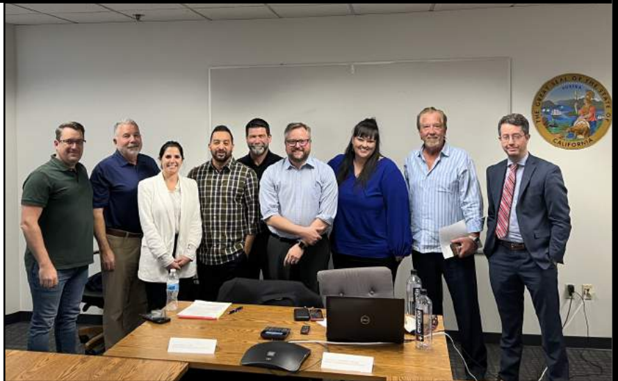
CMSA officers and members with BHGS staff at the December 8 Household Movers Permit Regulations Workshop