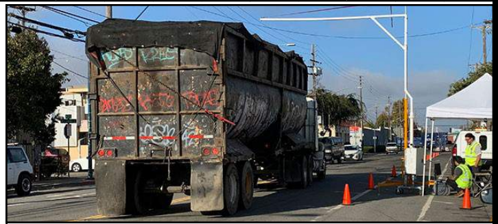
A truck is inspected in Oakland (CARB)

Older heavy-duty vehicles without OBD systems will continue the current opacity testing requirements with an added visual testing component, twice annually.