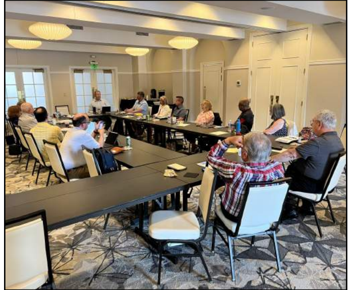
NCMA Meeting (June 2023) in Omaha, NE.

flight. As we prepared to land in Phoenix, the pilot came over the passenger address system and stated that our plane had the honor of transporting the remains of a fallen service member to his final resting place. He advised that we would remain in our seats until the casket had been removed from the plane and received by his waiting escort. It definitely puts things in perspective.