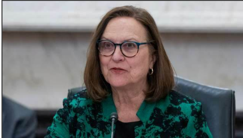
"We cannot allow bad actors in the shipping and moving industry to violate consumer trust and harm our nation's supply chain," Fischer said.