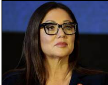
The Labor Department proposes to safeguard "workers' entrepreneurial spirit and simplify compliance for American job creators."

The Labor Department proposes to safeguard "workers' entrepreneurial spirit and simplify compliance for American job creators." March 2, 2026 4:12 PM, EST